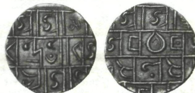
2. Rupee. Weight 11.5g. Diam. 26mm. Same obverse die, and similar reverse die to No. 1.

A coin similar to No. 1 was illustrated by J. Princep in "Useful Tables" (1834), giving a firm terminus ante quem. On stylistic grounds, however, I would place this variety among the earliest of the Bhutanese copies of the Narayani Rupee of Cooch Behar, and hence probably just before 1800 AD. This piece copies the light weight standard of the Cooch Behar coins.