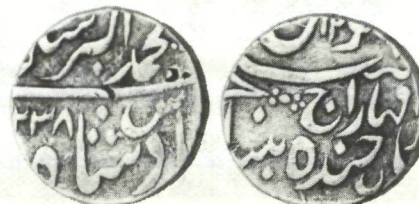
Maharaja rupee, 11.050 gms, 21 mm.