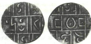
1. "Deb Rupee". Weight 4.6g. Diam. 20mm. Type 3 of the Inf. Sheet, with Tibetan letter ཨ (Ma) at top right of obverse. Dated c.1790-1840.

I have briefly described the coinage of Bhutan in ONS Information Sheet No. 10 (January 1977), but new discoveries continue to be made.