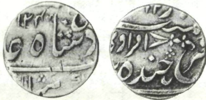
Amravati rupee, 11.100 gms, 20.5mm.

The coin, dated 1240, bears the usual legend of Muhammad Akbar II along with the mint name Farkhanda Bunyad Hyderabad and the word امراوٹی Amravati to the left of the 'Nizam's sword' on the reverse. A similar coin dated 1238 bears the word مہاراج Maharaj to the right of the sword. Both coins are illustrated below.